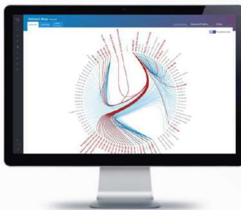
The SCADAfence Platform's Network Map

Remote Access Security – Get full visibility into remote access connections. Track and detect user activities that are out of the user's profile or are malicious in nature.