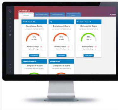
The SCADAfence Governance Portal's Central Dashboard

The SCADAfence Governance Portal measures compliance and monitors the progress made over time across all sites. It identifies all of the gaps and bottlenecks and allows users to generate systematic strategies to improve their organizational security at scale. The platform enables the IT and OT departments to centrally define and monitor the organizational adherence to organizational policies and to OT related regulations. The solution is easily deployed, is not intrusive, and does not jeopardize the process availability in any of the OT sites.