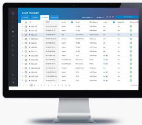
SCADAfence IoT Security's Asset Manager

SCADAfence offers a unique solution to address IoT security challenges with an innovative, centralized platform for IoT endpoint orchestration and management. You don't have to deal with hundreds of malfunctioning or quarantined IoT devices, you can manage and fix any security issues on your IoT devices with a single click. You can also proactively detect exposures to your IoT devices, even before your IoT devices can be compromised. The solution performs central orchestration, and is agentless.