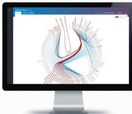
The SCADAfence Platform's Network Map

Remote Access Security – Get full visibility into remote access connections. Track and detect user activities that are out of the user's profile or are malicious in nature.